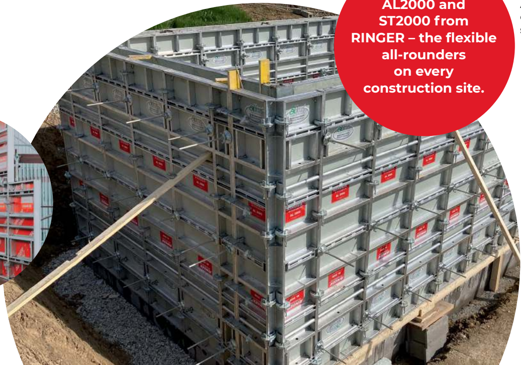
AL2000 with Alkus