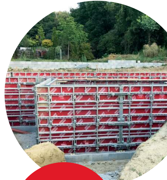
AL2000 construction site

AL2000 and ST2000 from RINGER – the flexible all-rounders on every construction site.