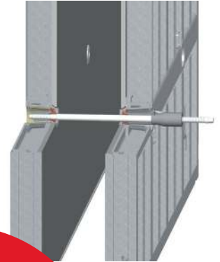
Master PRO anchor detail

Master PRO stands for highest efficiency levels, simple handling and excellent exposed concrete quality – well thought-out in every detail.