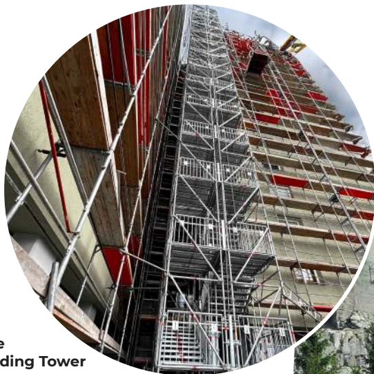
Galvanised double railing scaffolding