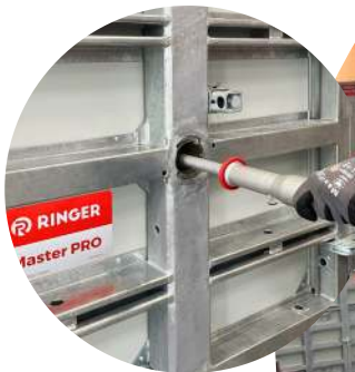
Master PRO anchor

Master PRO stands for highest efficiency levels, simple handling and excellent exposed concrete quality – well thought-out in every detail.