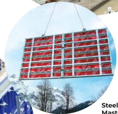
Steel Master element